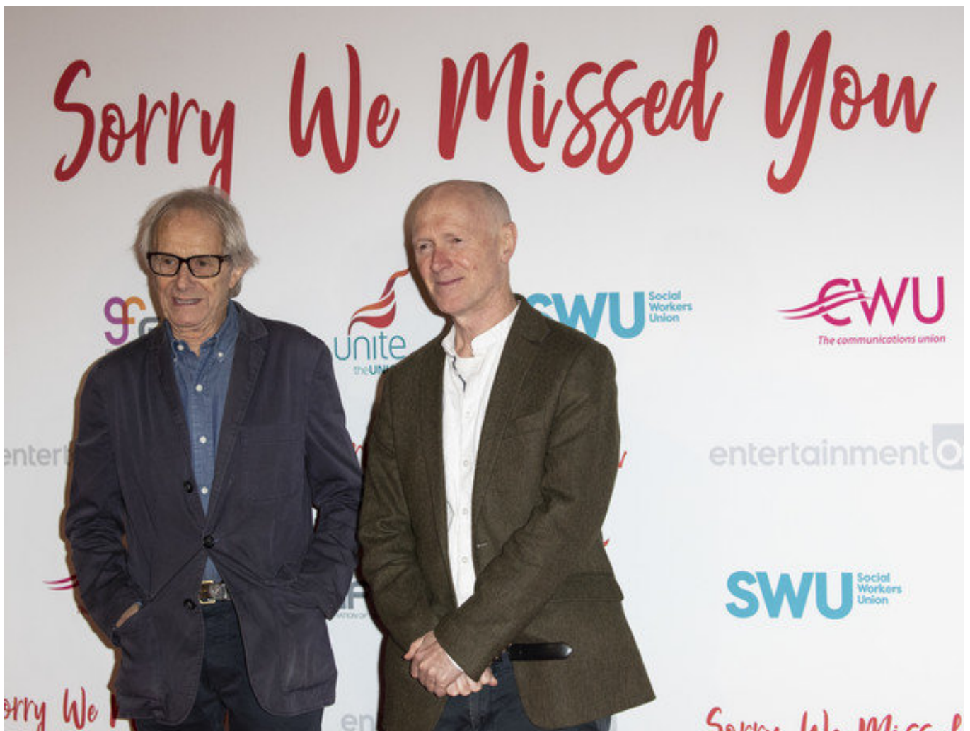
Ken Loach and screenwriter Paul Laverty photographed on the red carpet at the premiere of Sorry We Missed You in 2020. The SWU logo is displayed prominently in the background.

We also reiterate our ongoing commitment as a union to fight against antisemitism and racism in all its forms. All SWU members who experience discrimination have access to our fantastic Trade Union Advice and Representation Service who will fight on their behalf.