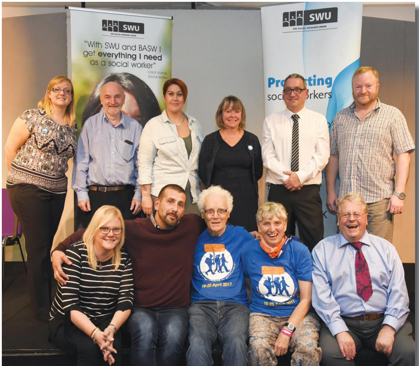
SWU Executive 2018

“Remember that SWU membership guarantees employment representation. Membership of BASW does not. Paying an extra £20 (£10) a year is great value.”